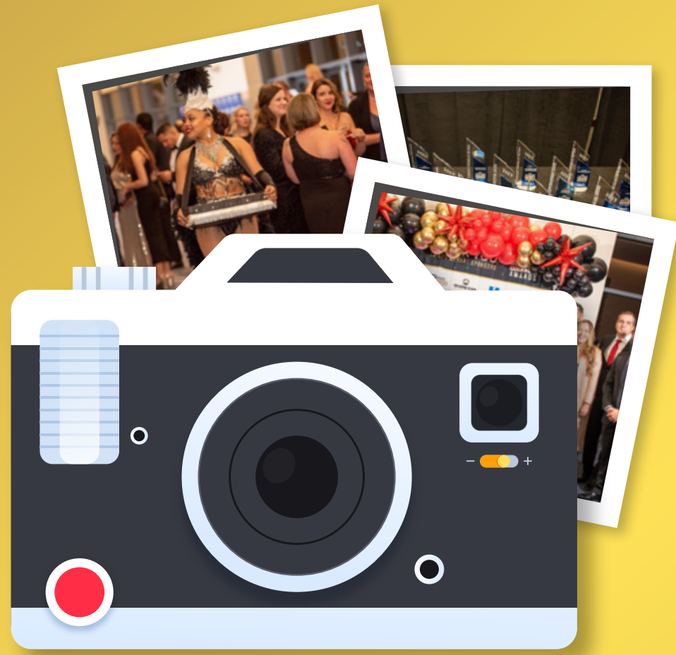
PHOTO BOOTH SPONSOR

The Photo Booth Sponsor brings unique exposure throughout the evening, and it is a popular fun feature all guests partake in and make memories along with them. Your brand, of course, goes with them. Plus, you get to invite 10 guests to enjoy construction's most sought evenings of the year.